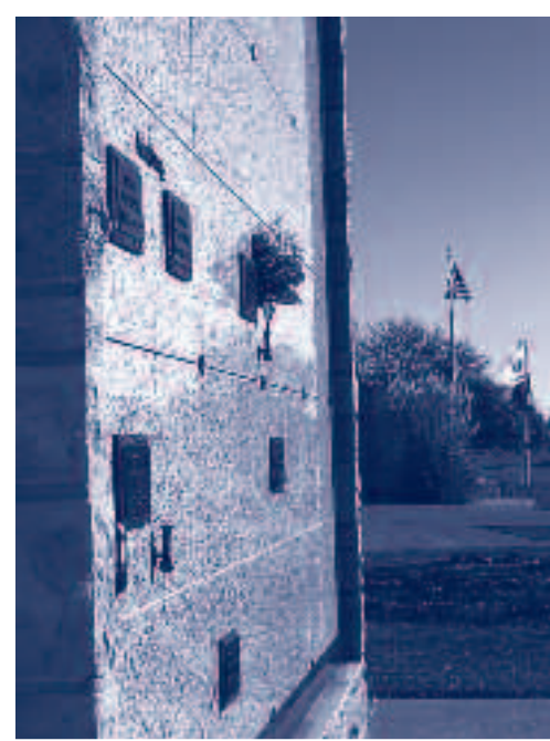
Photos: Clockwise from top left; Heroes Garden Plaque, Old Rugged Cross Garden, New Crown Garden Mausoleum, Heroes Garden, and the Garden of Christus.